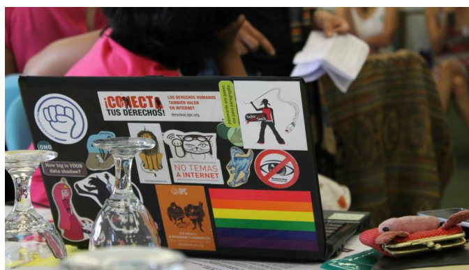
Chapter 3. Playing with tech