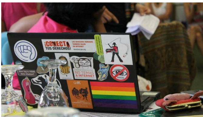
Chapter 3. Playing with tech