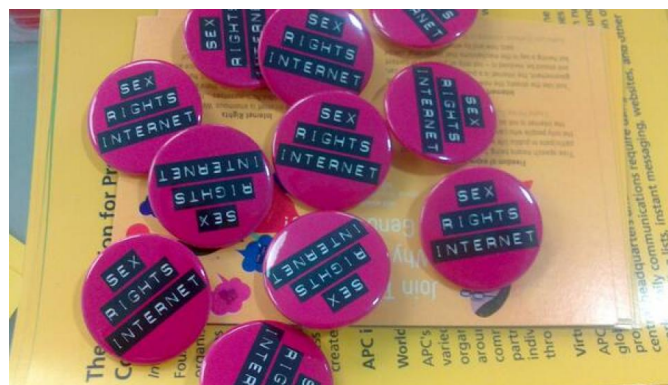
Chapter 2. Holding space and getting to know each other