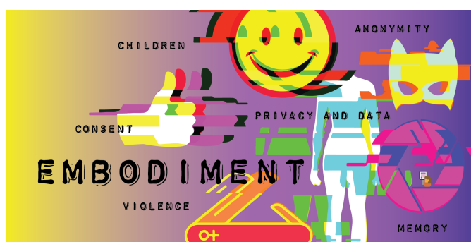
Chapter 4. How to introduce the FPIs