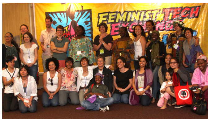
Chapter 1. How to organise an FPI convening

Read through each section, or jump to the sections that interest you the most using the page links in the table of contents!