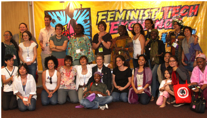
Chapter 1. How to organise an FPI convening

Read through each section, or jump to the sections that interest you the most using the page links in the table of contents!