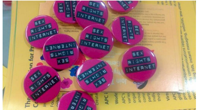
Chapter 2. Holding space and getting to know each other