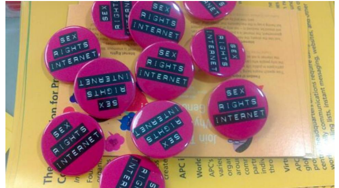
Chapter 2. Holding space and getting to know each other