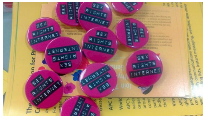
Chapter 2. Holding space and getting to know each other